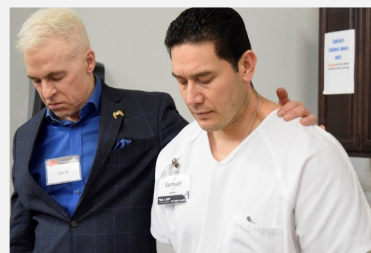
A moment of prayer