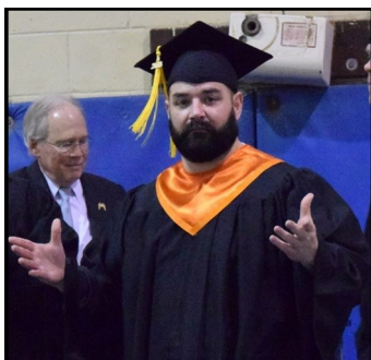
3rd place winner for his BPC event