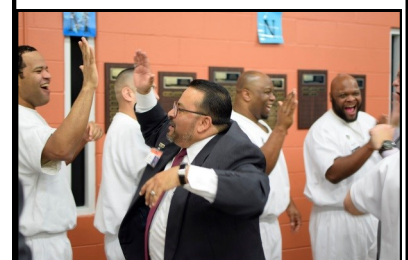
PEP's Tunnel Of Love